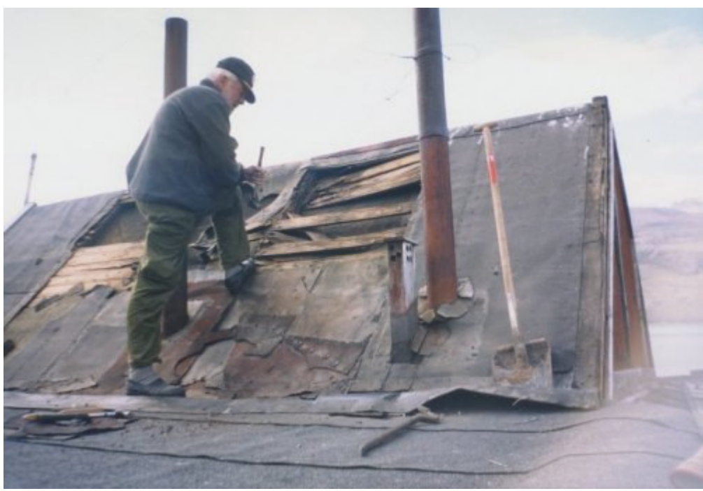
Photo: Jannik on the roof of Hoelsbu. Especially the north side roof needed the repair badly.

We had been informed that the roof of Sirius' storage room was leaking. We therefore concentrated on the station's north side first. However, it turned out to be in poorer condition than first assumed. The roof boards on the north side of the main house had in many places crumbled or rotted away. Since we did not have any boards, we decided to sacrifice an old fur house, situated app. 200 m north of the station. The house was not up to much, but the boards were in fairly good condition. The roof beams on the main house were reinforced and new roof boards nailed on. Then new under-felt - and in the end top felt welded on. The top cover of the main house's north side was repaired, since it was partly rotten. A peat wall was digged up and roofing felt prolonged to the bottom of the house. Furthermore we applied new under- and top felt on storage room, bath, coal room and workshop. In the workshop the roof was reinforced with a 4 x 4 inch beam, which we took from an old cage.