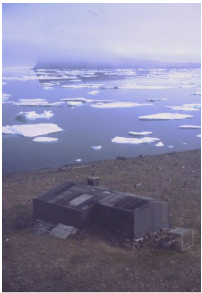
Photo: The helicopter surveillance to Germaniahavn showed that there were large, open holes in the roof. Inside, the walls were running.

On August 3 there was an opportunity to do some ice scouting to Germaniahavn with the helicopter from "Kista Arctica". This proved very useful, since it could now be confirmed that wind and current in the meantime had opened the ice for sailing all the way to Germaniahavn. At the same time, we got a very useful impression of the condition of the house and which tasks were waiting us there.