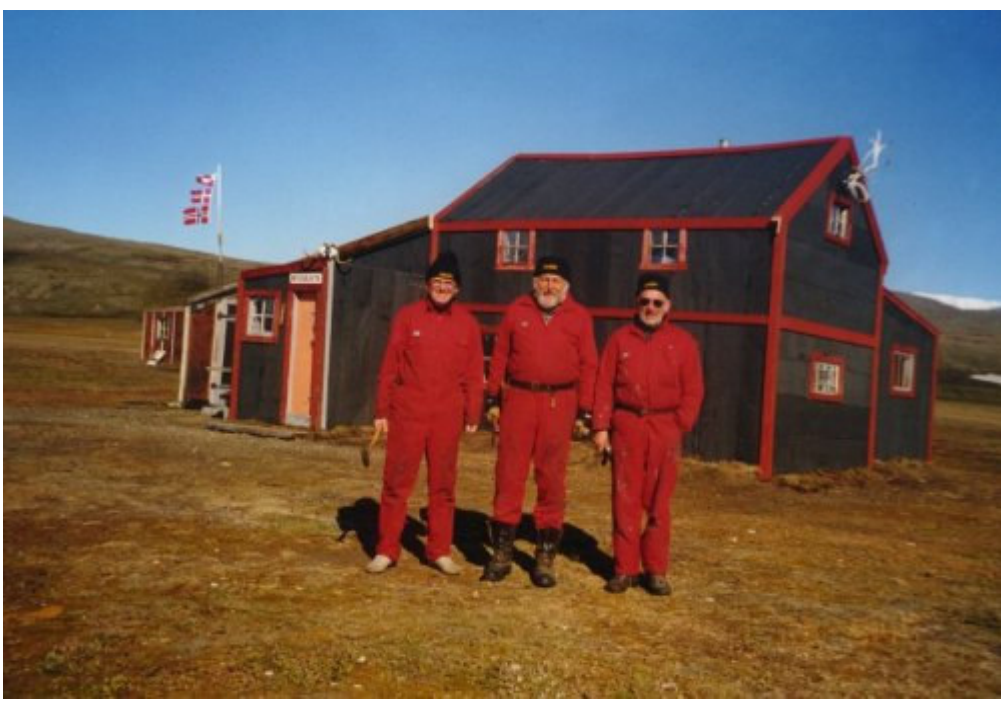
Photo: Myggbukta seen from north-east the morning snow came. Autumn is near.