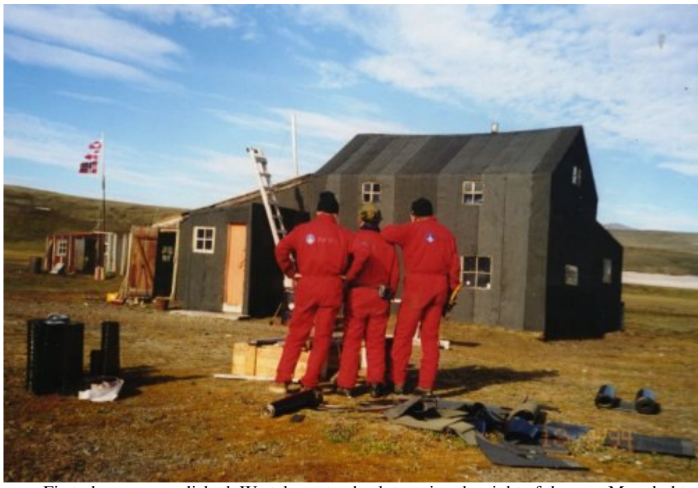
Photo: First phase accomplished. We take a step back to enjoy the sight of the new Myggbukta.