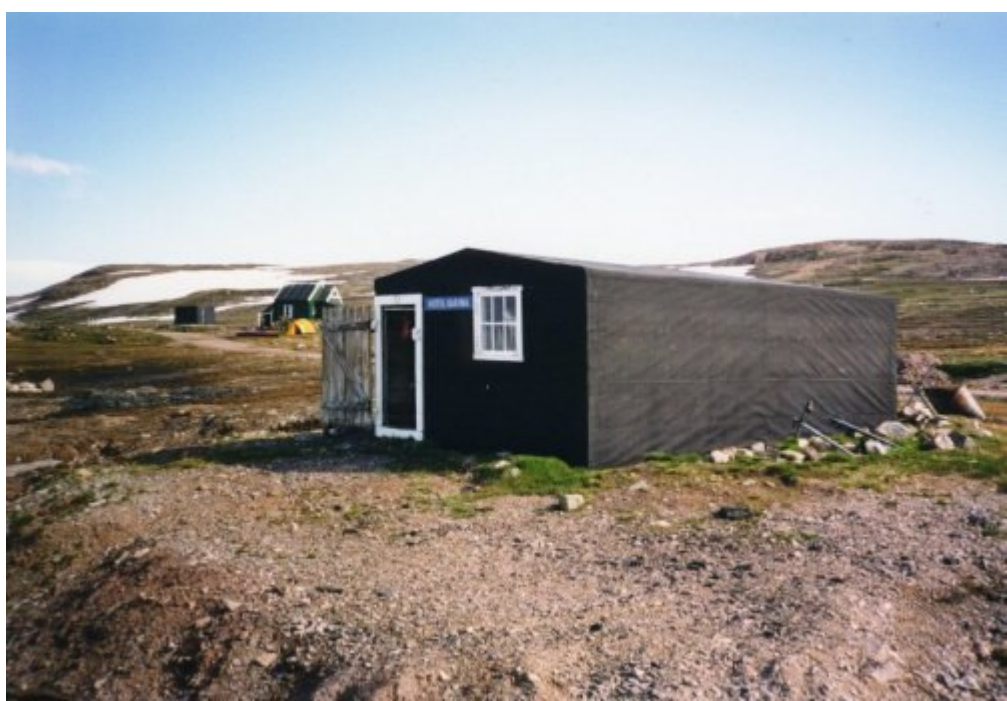
Photo: Hotel Karina, where a historical collection will be established. Sandodden is seen in the background to the left.

In later years, Sirius has carried out a substantial extension and renovation of Daneborg. This has given the patrol ample new storage room and thus made it possible to leave the cabins Black Shed and Hotel Karina - situated close to Sandodden and Fur Shed - to Nanok. Seen in relation to the expected scope of the mentioned culture-historical collection, it was quite natural to pick Hotel Karina - the largest house apart from Sandodden - for this purpose. Sandodden, though, will be emptied as much as possible of "movables" and must in the future stand ready as habitation and base for Nanok's summer activities in the North region, as well as for other travellers, who will here get a realistic impression of what living in a real trapper cabin used to be like.