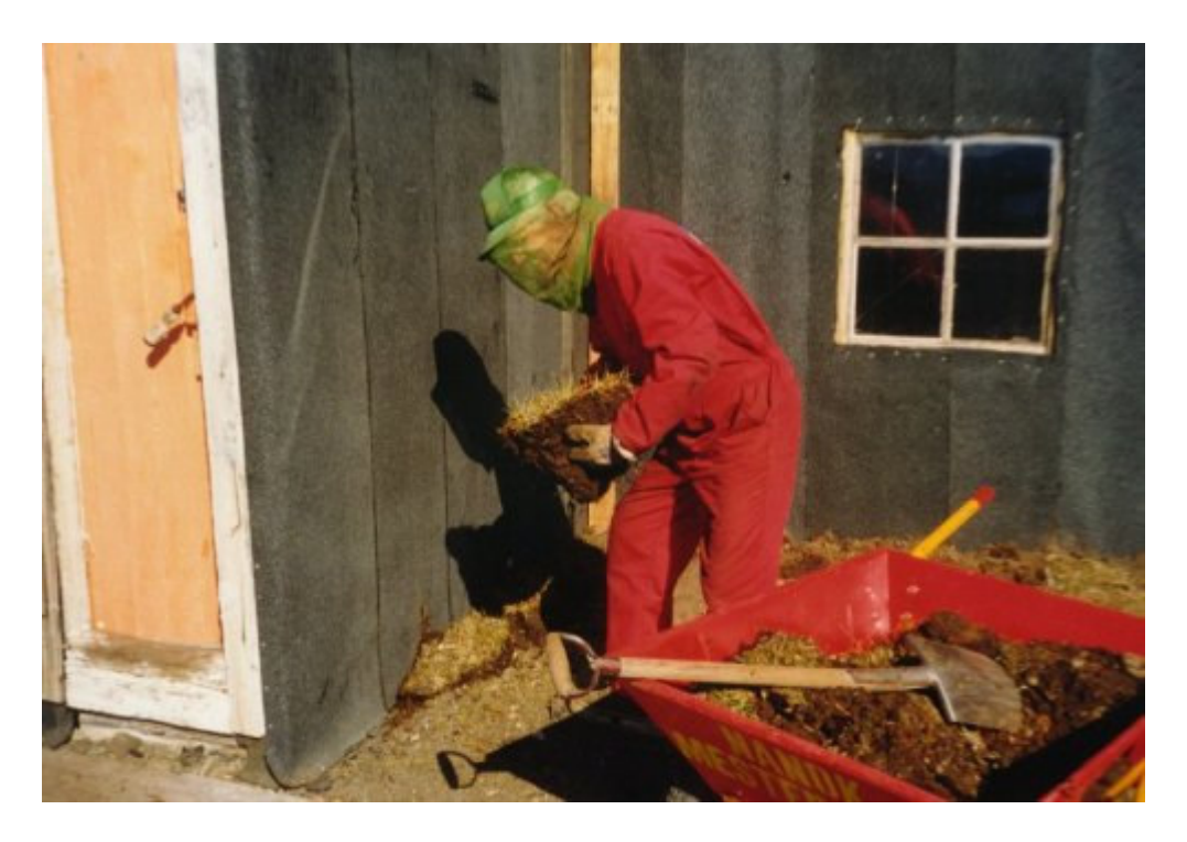
Thor builds a new dirt wall