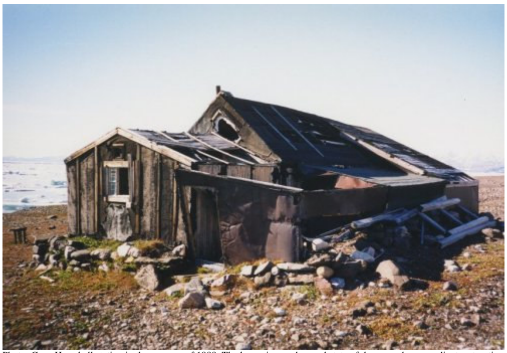
Photo: Cape Herschell station in the summer of 1999. The house in an advanced state of decay, and an expedient restoration is needed if the station is to be preserved.

In connection with the journey we had, apart from sites in the Germaniahavn area, visited and by GPS precisely identified the following localities: Hansa Bugt hytten, Ingrid Havn, Hansa Bugt ruins, Koppernes Hytten, Gåsenes hytten, Liavåg, Augusta Dal hytten Hermannsbu, Borlase Warren hytten, Valdemars Håb, Borganes, Kap Herschell, Grønlænderhuset and Kap Berghaus hytten.