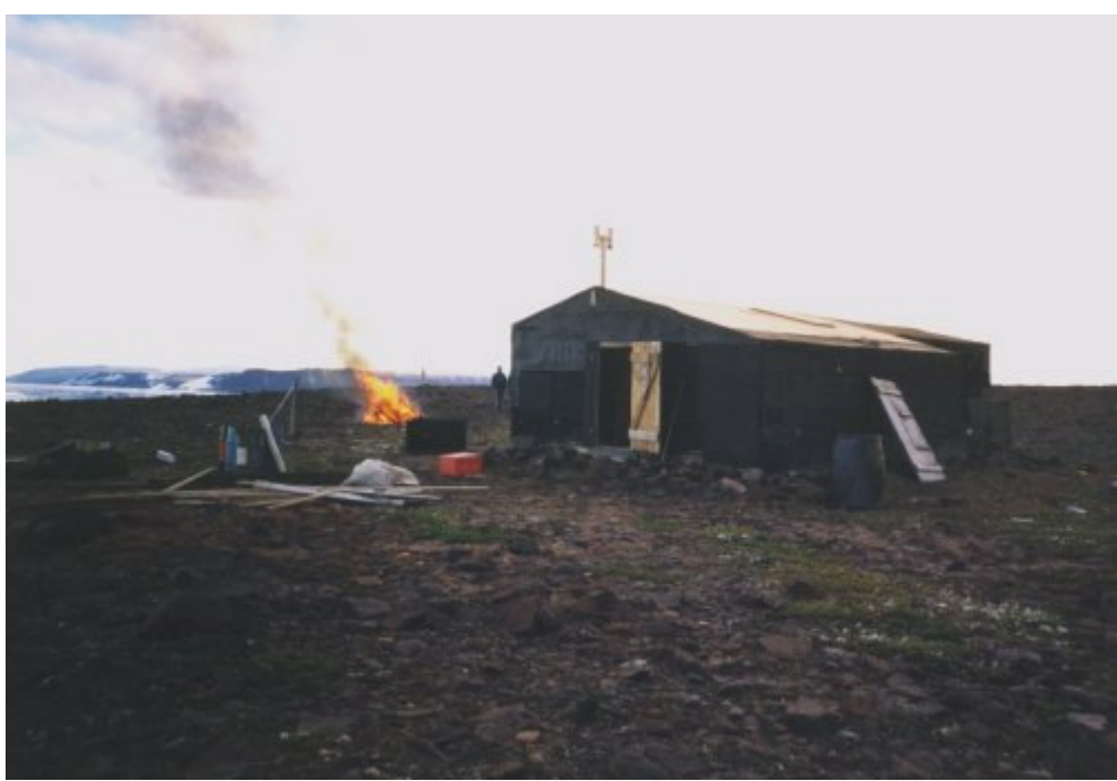
Photo: The old rotten wood from roof and ceiling were burned. The rotten boards were exchanged and the roof waterproofed with plywood plates.

Thanks to good weather we succeeded, and when we left Germaniahavn for good on 13 August, the house had a new, extra roof cover over the repaired plywood roof, and outermost a brand new cover of roofing felt. The pasteboard on the sides of the house were also repaired. On the inside, the damp ceiling of masonite and the rotten boards were removed. Walls and floors were washed clean of mould and dirt. A new stove was installed and the house was dried out.