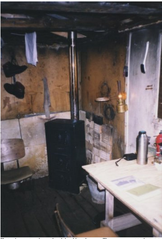
Photo: A new stove has replaced the old, useless one. The oven was put to the test, to dry out the house thoroughly. The old ceiling plates were torn down, so that the beams are not visible. Floor and walls are washed clean of mould and dirt.

Already on 10 August the house proved its resistance during a wind that left 5-10 cm of snow - but only outside the house. It is our belief that Germaniahavn has now become a good and well-functioning house. The task for a future Nanok team lies in exchanging the pasteboard on the sides of the house (the necessary pasteboard is now on the site) and possibly repairing/exchanging the floor of the back room, which is rotten and only needfully mended with two left-over plywood plates.