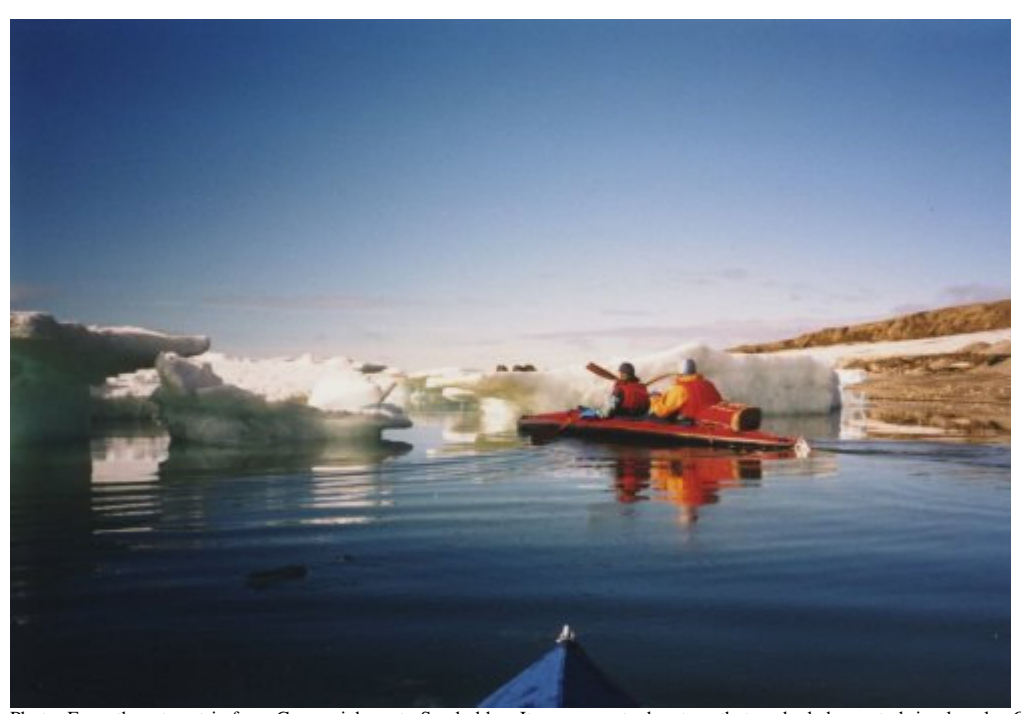
Photo: From the return trip from Germaniahavn to Sandodden. It was a great advantage that we had chosen to bring kayaks. On the whole stretch between Dronning Augusta Dal and Cape Berghaus the ice lay quite densely and close to the shores.

We did, however, manage to investigate the Germaniahavn area, including finding and marking an app. 180 m long, acceptable STOL runway. It can be found on the GPS position: 74° 32'418"N, 018° 51'202"W on a flat, dry area in the bottom of Germaniahavn, and is marked by four stones painted red.