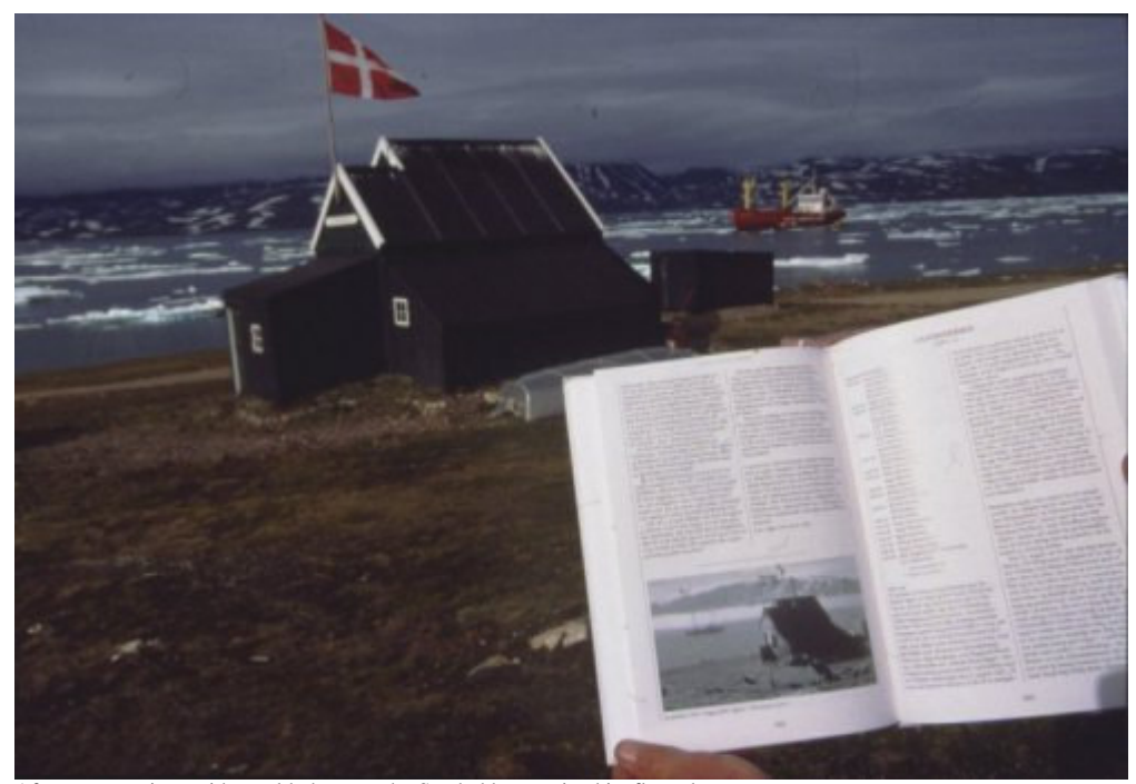
After a comparison with an old photography Sandodden regained its flagpole.

Then on 31 July this year's supply ship "Kista Arctica" arrived, and we had the opportunity to assist Sirius during the unloading activities. The ship was moored at Sandodden, a scenery much resembling an old photograph from 1937, where the sealer "Quest" was anchored in almost the same position. This photograph shows that Sandodden had a flag pole on the gable then. When the flag pole disappeared is unknown, but the photograph spontaneously lead to the idea of a re-installation, and soon the Danish flag once more waved over Sandodden on a provisional pole. With regard to flagging otherwise, the Greenland Home Rule has kindly sponsored Greenlandic flags to Nanok, and these are now used in connection with our work "in the field".