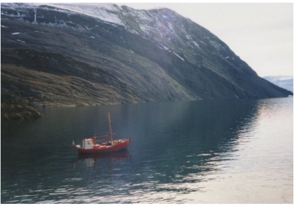
Photo: The Hoelsbu team used the motor boat "Agsut" for transport to and from Mestersvig. Here the Blomsterbugten is visited.

When we arrived the ice had unfortunately not yet broken up in Kong Oscar Fjord, so sailing with "Agsut" was impossible for the time being. Each day we ice scouted from land, and otherwise made ourselves useful where we could. After well over a week the ice situation seemed to improve. The Mestersvig people launched their new rubber boat and took us scouting into the fjord. Still a lot of ice, but with a bit of caution we managed. We therefore decided to launch our ship the next morning - and succeeded, with great help from the Mestersvig people, with Dan behind the steering wheel of the loader tractor. Then we loaded Agsut with roofing felt, gas bottles, food supplies, etc.